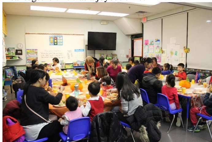
Families enjoying a “Taste of Thanksgiving”

For the first time, we opened our Taste of Thanksgiving event to the families. Traditionally, this event was for our students only, to give them an idea of what an American Thanksgiving meal would look and taste like. Year after year, our students love this experience. To give this same experience to our families, we invited them to come and partake in this meal together. It was a joyous time!