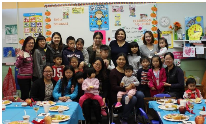
Fall 2019 Parent Essentials Saturday Cohort

the Boston education system, equipping them with skills and confidence to advocate for their children, and attendance itself!