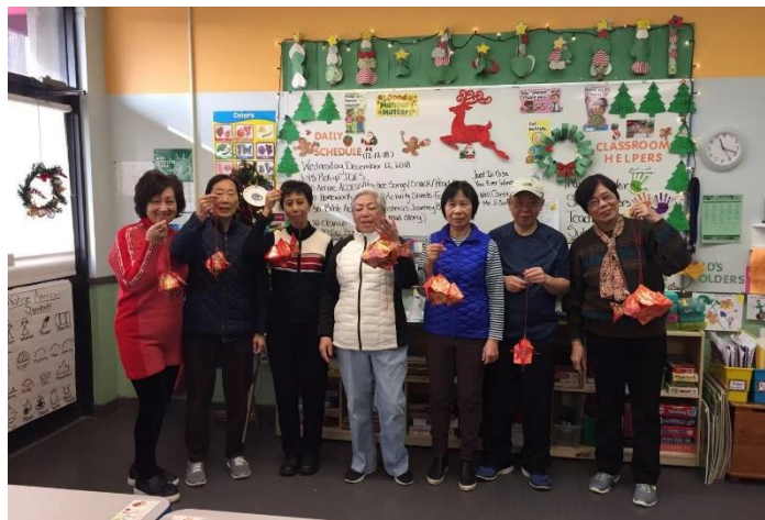
Art and Crafts for Elders Class

In 2018, we started a fitness and soft stretching class for Tai Tung Village senior residents. We had 9-10 regular students attending this class twice a week for 6 months. Our staff and volunteers also provided free art and crafts classes for seniors living in Tai Tung Village. We had 5-8 participants who attended 6 art sessions. They enjoyed creating with winter and holiday art, Chinese paper art, and calligraphy. Our expanded services to elders helped them to improve their physical mobility and mental and emotional health. We are looking for grants to continue our program for elders in the coming year.